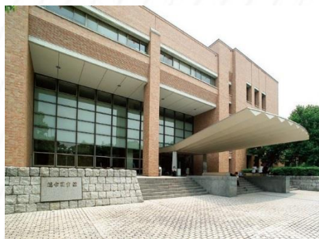
Media park RINPUKAN