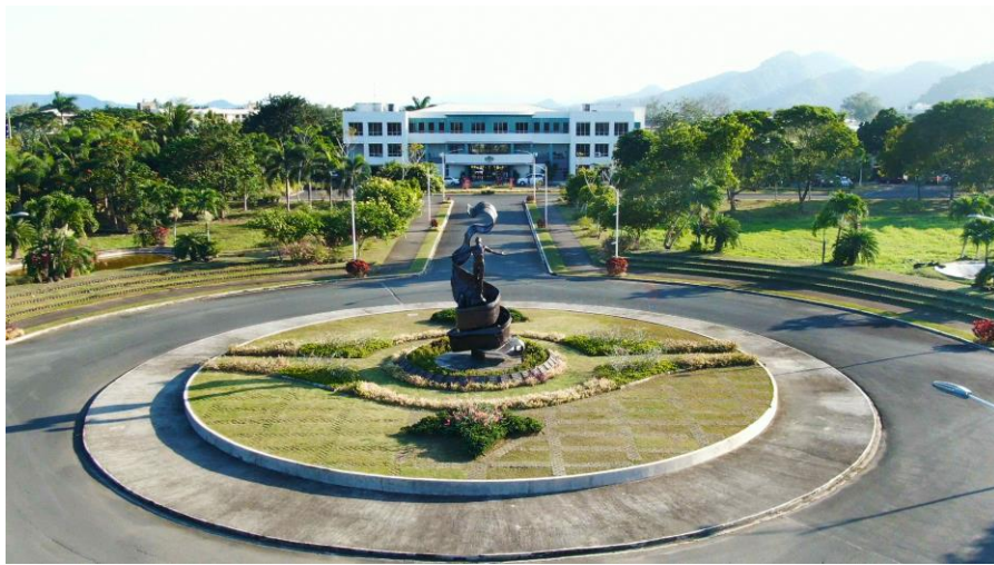
The UPOU main campus in Los Baños, Laguna sits at the foot of Mt. Makiling

The main venue of the youth cultural and learning immersion program is at the UPOU main campus in Los Baños, Laguna. Taiwanese youth will be billeted at the UPOU Academic Residences for the entire duration of the said program.